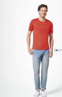
MURPHY MEN 01836