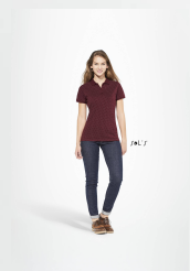
BRANDY WOMEN 01707