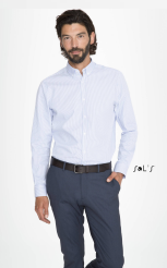
BEVERLY MEN 01650