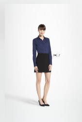
BECKER WOMEN 01649