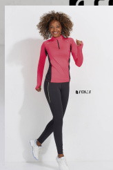
BERLIN WOMEN 01417